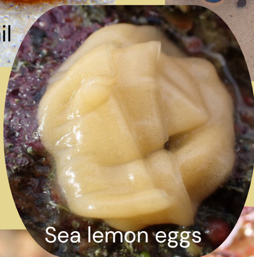
Sea lemon eggs