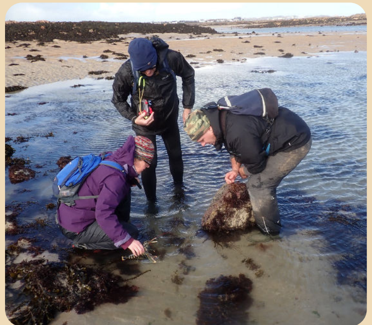
Members during the La Rocque discovery session