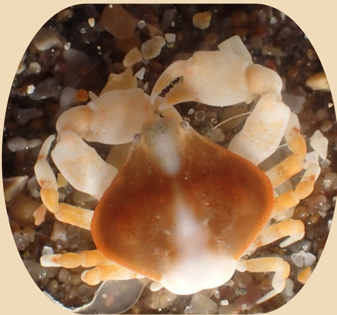
Bryers nut crab