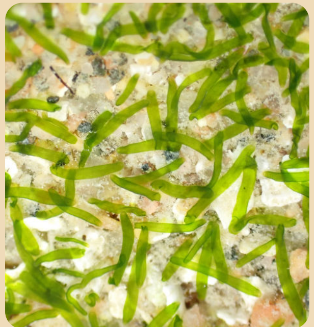
Symsagittifera roscoffensis Mint sauce worms