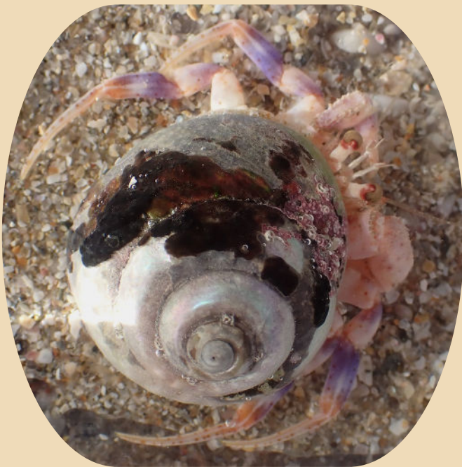
Prideaux's hermit crab

The sighting of the Aeolidia filomenae is the first Channel Island record, although members are sure they have seen them before, highlighting the importance of recording your findings!