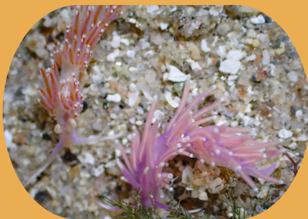
Facelina auriculata & Edmunsella pedata