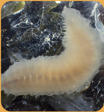
Alentia gelatinosa L'Tetons