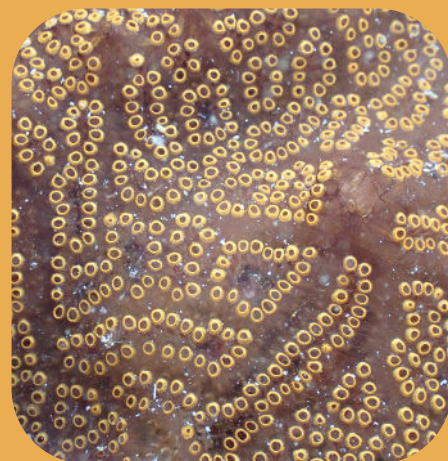
San Diego sea squirt La Rocque