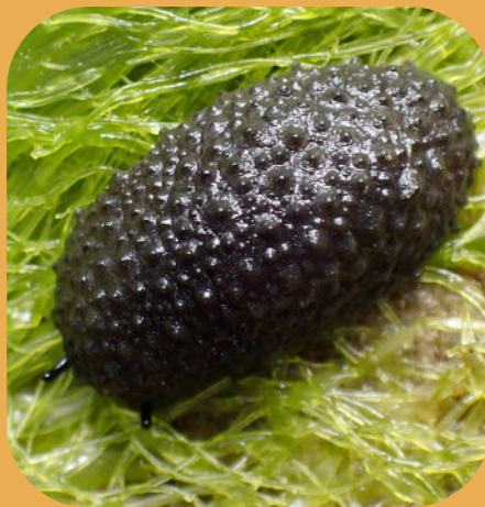
Celtic sea slug La Rocque