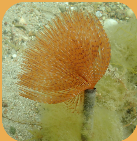
Mediterranean fan worm